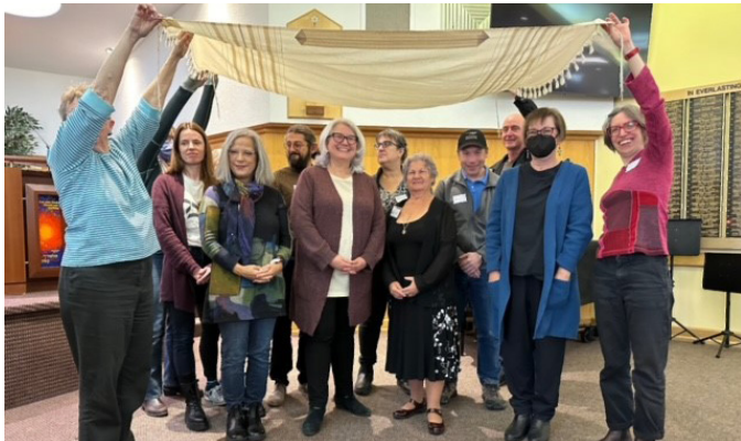
New board of directors was installed at the Annual Meeting