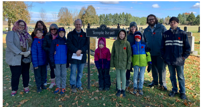
TiRS grades 5&6 visited Jewish Memorial Gardens to learn about Jewish customs.