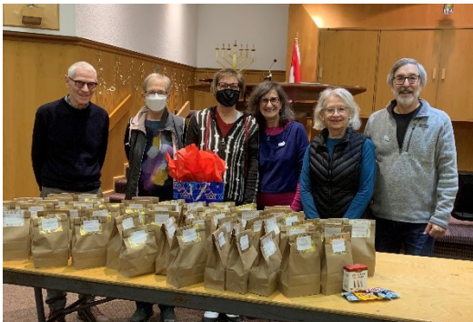
Team members packed dozens of Hanukkah bags