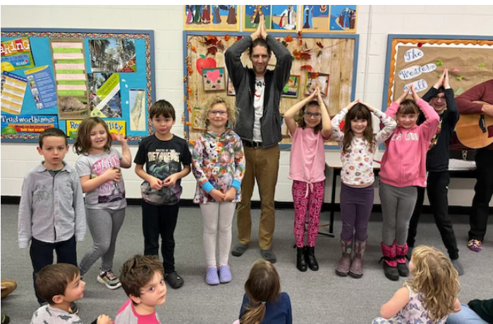
TIRS preparing for Chanukah