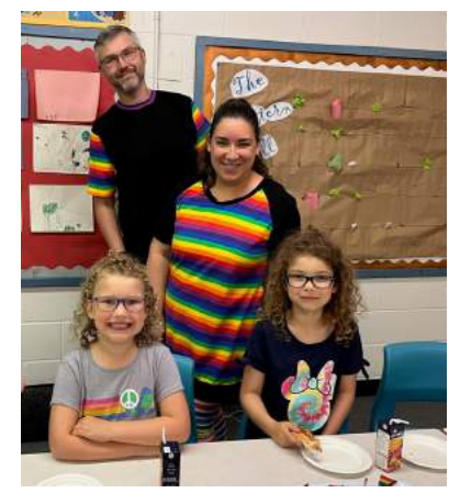
Sturgeon family joins to celebrate Pride