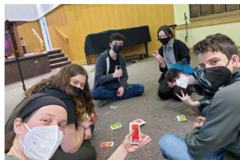
FROSTY at games night

Stay tuned for more activities through March and April, culminating at the end of April with a NFTY-NEL kallah at URJ Camp George, yay!