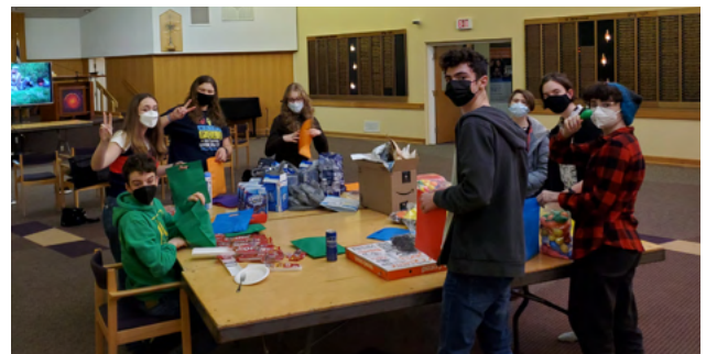
FROSTY group preparing the Michloach Manot