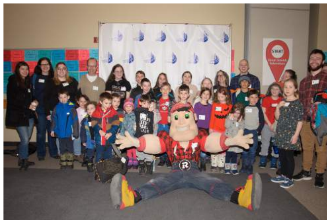
TIRS attends Mitzvah Day with Ottawa Redblacks mascot Big Joe