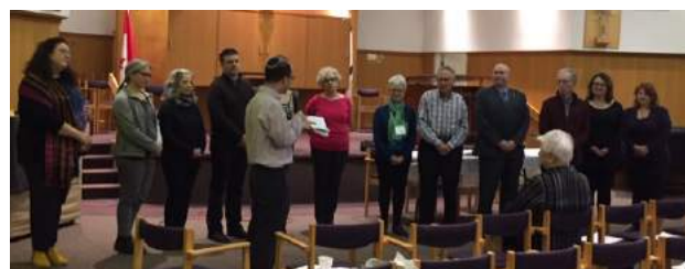
Rabbi installs new Board of Directors at AGM.