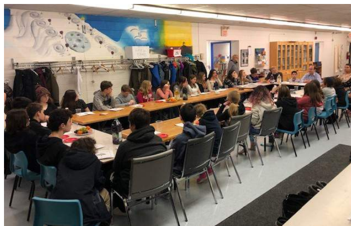
Grades 6-11 celebrate with a Tu B'shevat Seder