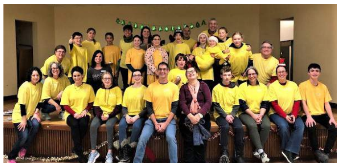
Such an amazing representation of Temple Israel and TIRS families volunteering at In From the Cold at Parkdale United Church in December. What an awesome example of how Tikun Olam is so important to us.