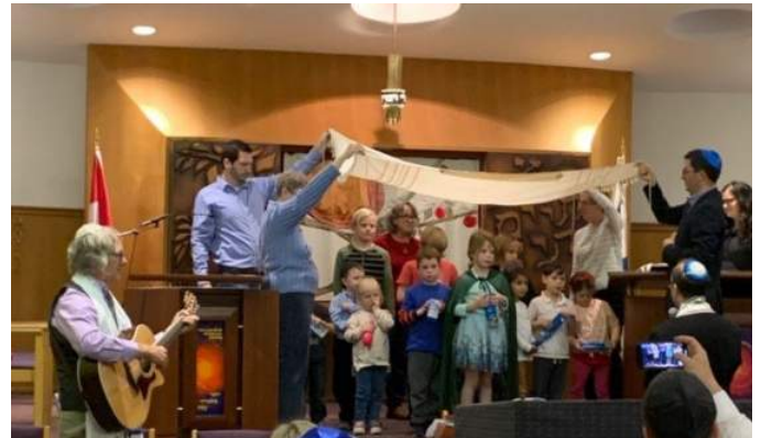
Celebrating Consecration & Simchat Torah