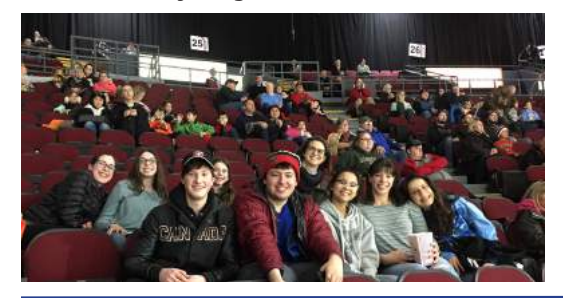
FROSTY goes to a hockey game!

How do you end a love letter? You don't. It just goes on and on.