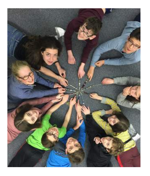
TIRS Grade 7 class show off their yads