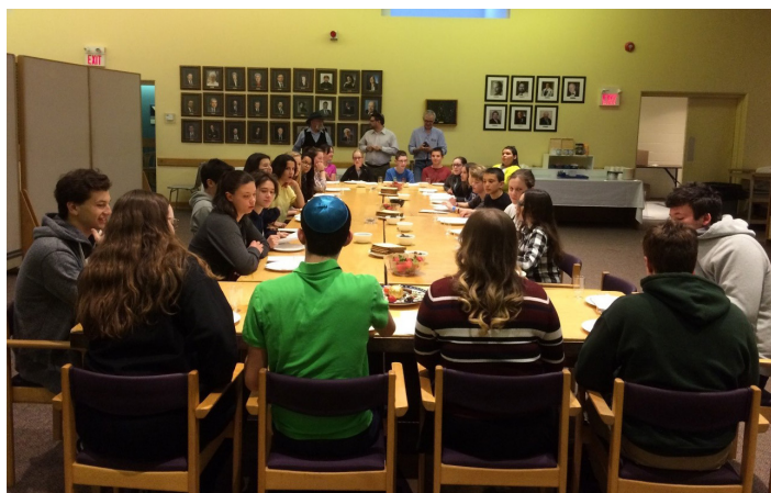
Almost 30 teens in Grades 6-12 gather at Temple Israel for FROSTY's annual Chocolate Seder attended by youth in TIRS, JYG, FROSTY and other Temple Israel youth.