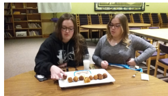
Iron chef judges have their work cut out !