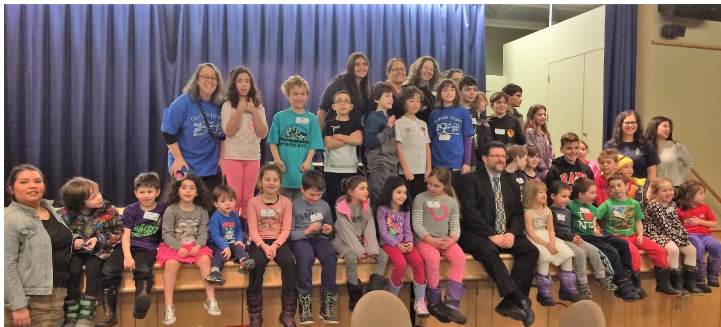
Temple Israel Religious School participates at Mitzvah Day 2017