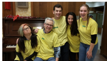
In from the cold