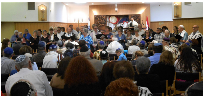
Shlichei Tzibur team and choir members at June 10 Shabbat