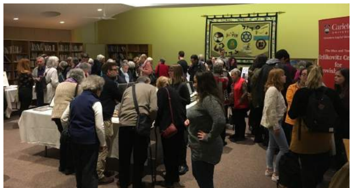
Attendees at the Pop Up Museum reviewing the exhibits