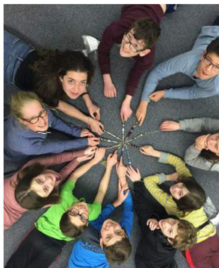
TIRS Grade 7 class show off their yads