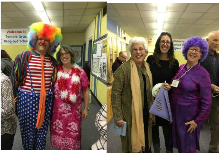
Temple celebrates Purim!