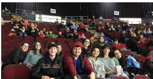
FROSTY goes to a hockey game!